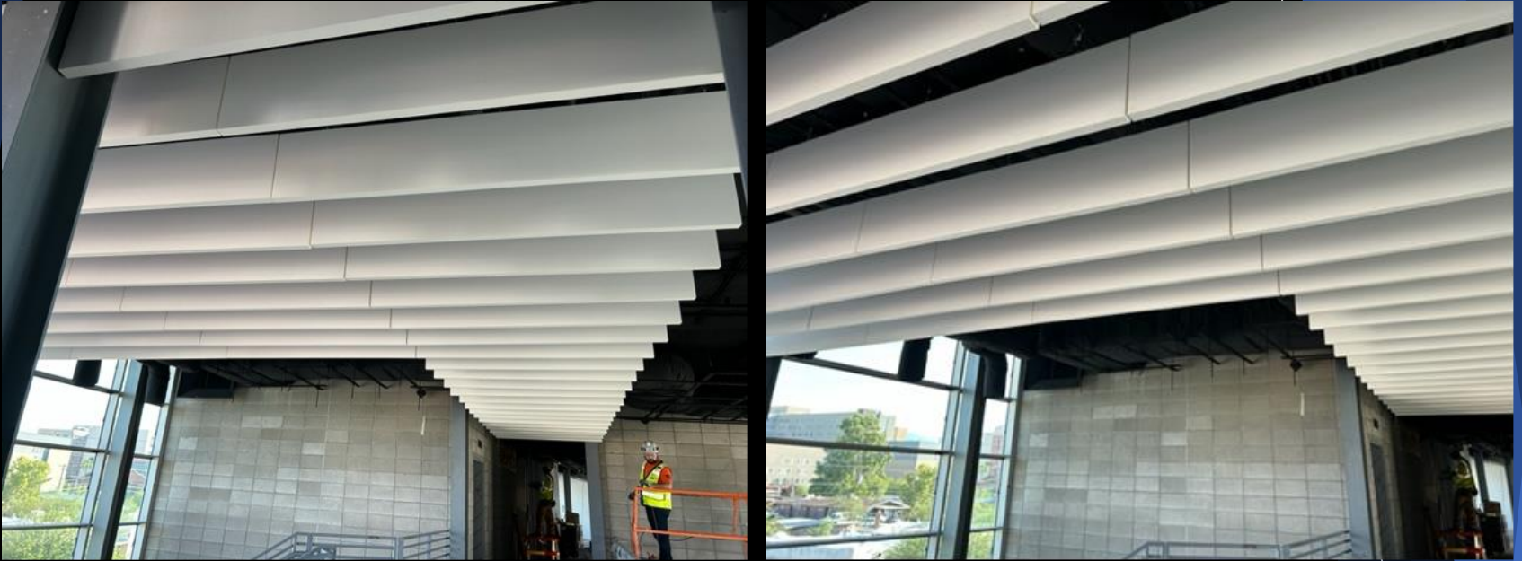
Office Bldg: Lobby Ceiling baffles installation