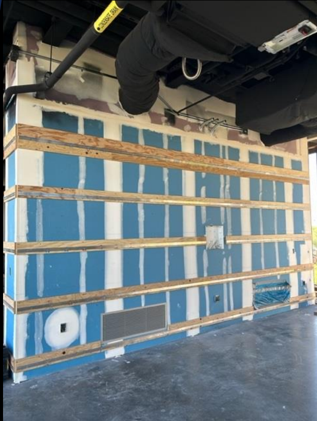
Office Building - Supports for wood panels installed