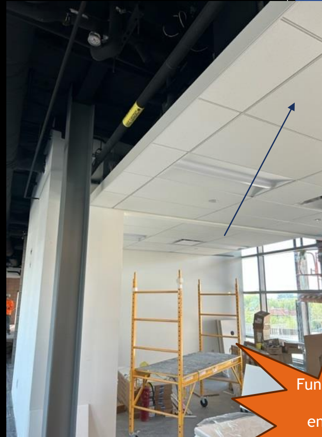
Office Bldg: Level 3 - ACT Tile installed & walls painted

Fun fact: ACT tile is a LEED environmental product.