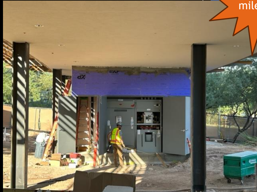
Office Bldg: Power is ON inside the building as of 9/28