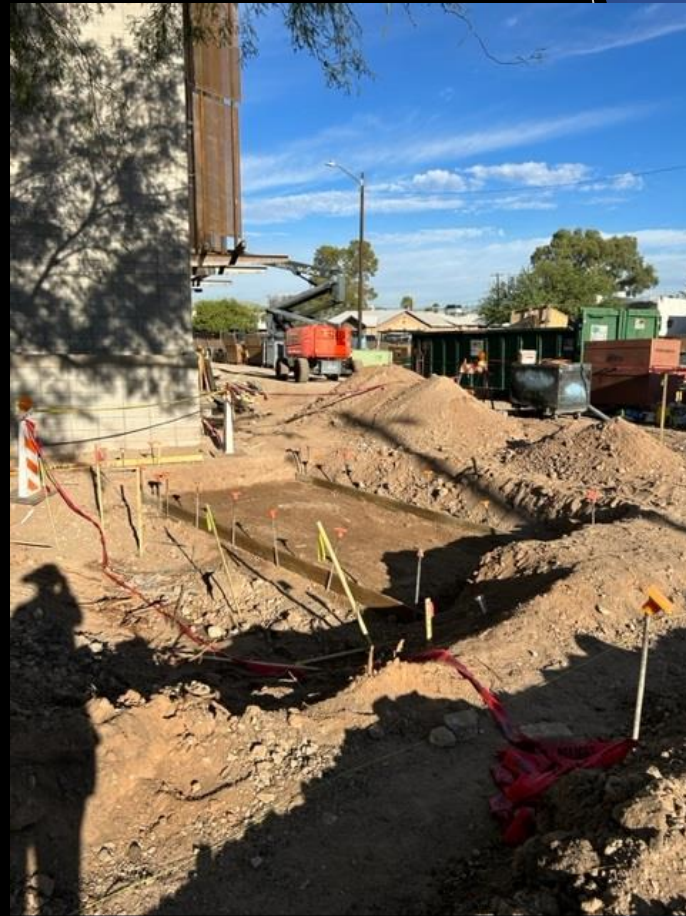
Site: Grading east & south. Forming sidewalks and footings for scuppers.