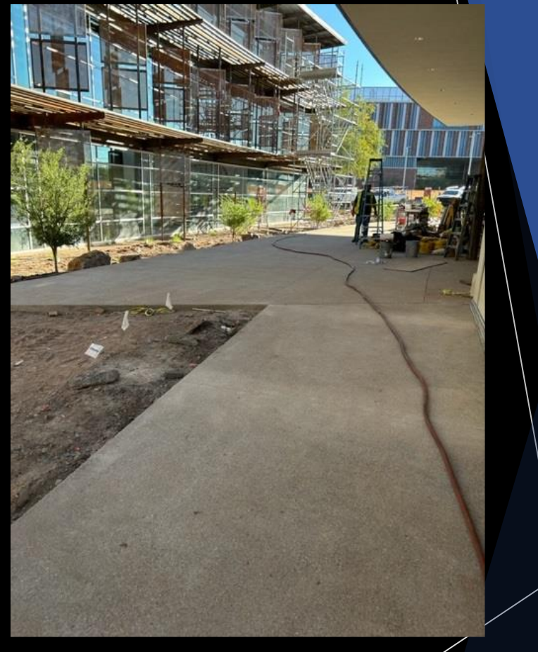
Site: Concrete pours every day