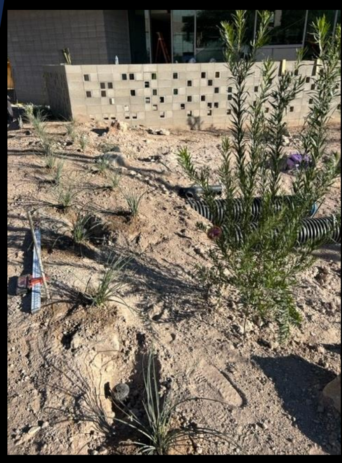
Site: Planting on-going.